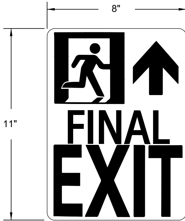
EM-SREFAR-8X11 (Shown) Running Man Exit Final Arrow Right