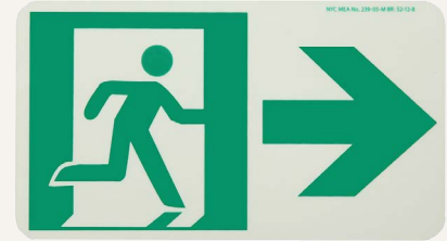
Running Man with Arrow

The Safe-T-Lume NYC Compliant Running Man Signs features the code required running man and various directional arrows and labels. This sign comes with adhesive tabs for easy wall mounting.