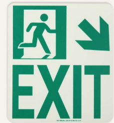
Running Man Arrow Exit