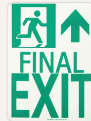
Running Man Final Exit