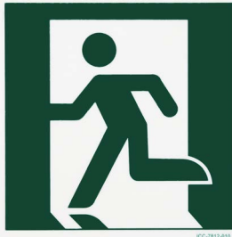
Left Running Man Sign