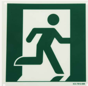
Right Running Man Sign

Safe-T-Lume Running Man Signs provide a non-electric luminous egress routing system that is easily followed in the case of power loss in an emergency situation. Required by code, the standard running man symbol identifies the direction of egress. The material has been tested to UL 1994 and meets current IBC, IFC, and NFPA code requirements.