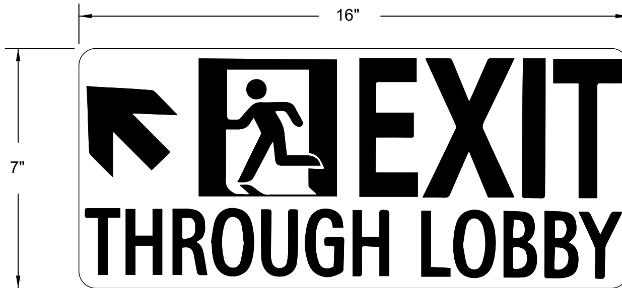
EM-SRELAUL-16X17 (Shown) Running Man Exit Lobby Arrow Up Left